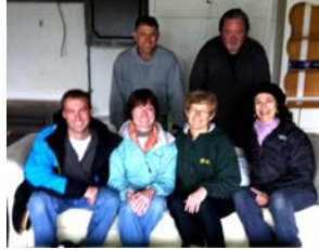
Jesuit teacher volunteers

We concluded by taking a ride in the simulator so we could feel what it was like to ride in different planes/jets with the corresponding scenic screen in front of us. Such fun!